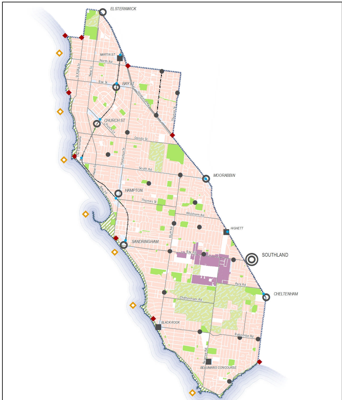
Map 1 – Existing Land Use Types