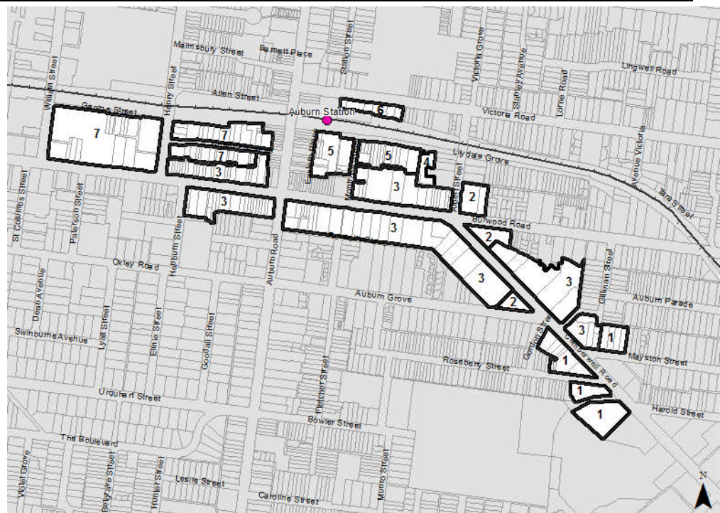
Map 1 Burwood / Camberwell Road Commercial Corridor - Built Form Areas

Note Site constraints or context may mean it is not appropriate to develop to the full extent of the building envelope established by the building heights and setbacks specified in this Schedule.