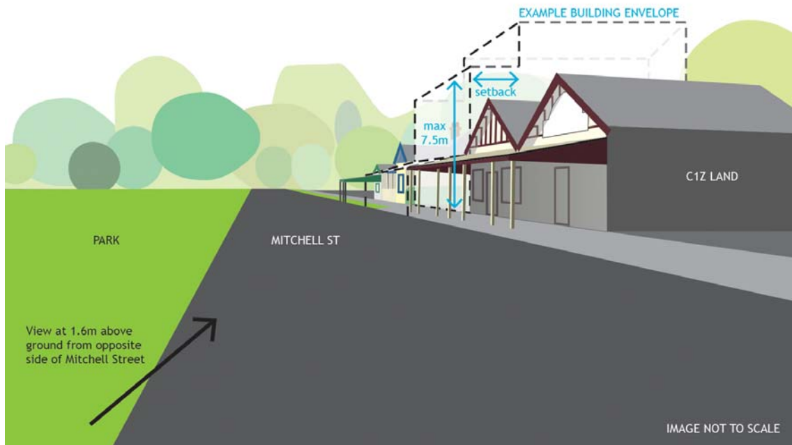
Figure 2 Illustration of Building Façade Controls