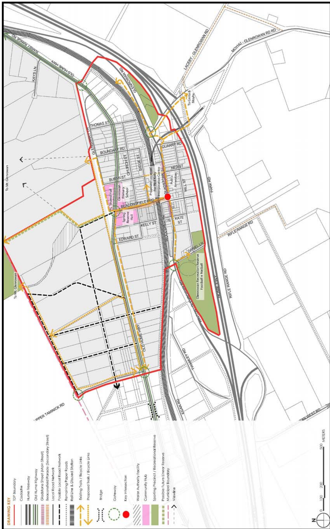
Figure 1 – Glenrowan Access, Movement and Open Space Plan